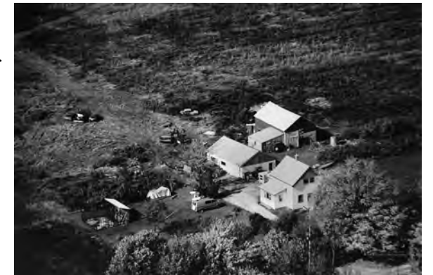
The property in 1982.

The foundation of TLC's educational approach is holistic, blending insights from in-depth studies of nature, contemporary science, ancient traditions, and a profound inquiry into life's mysteries. TLC remains committed to its mission of deepening connections with nature and is now broadening its scope to collaborate with external partners and event organizers.