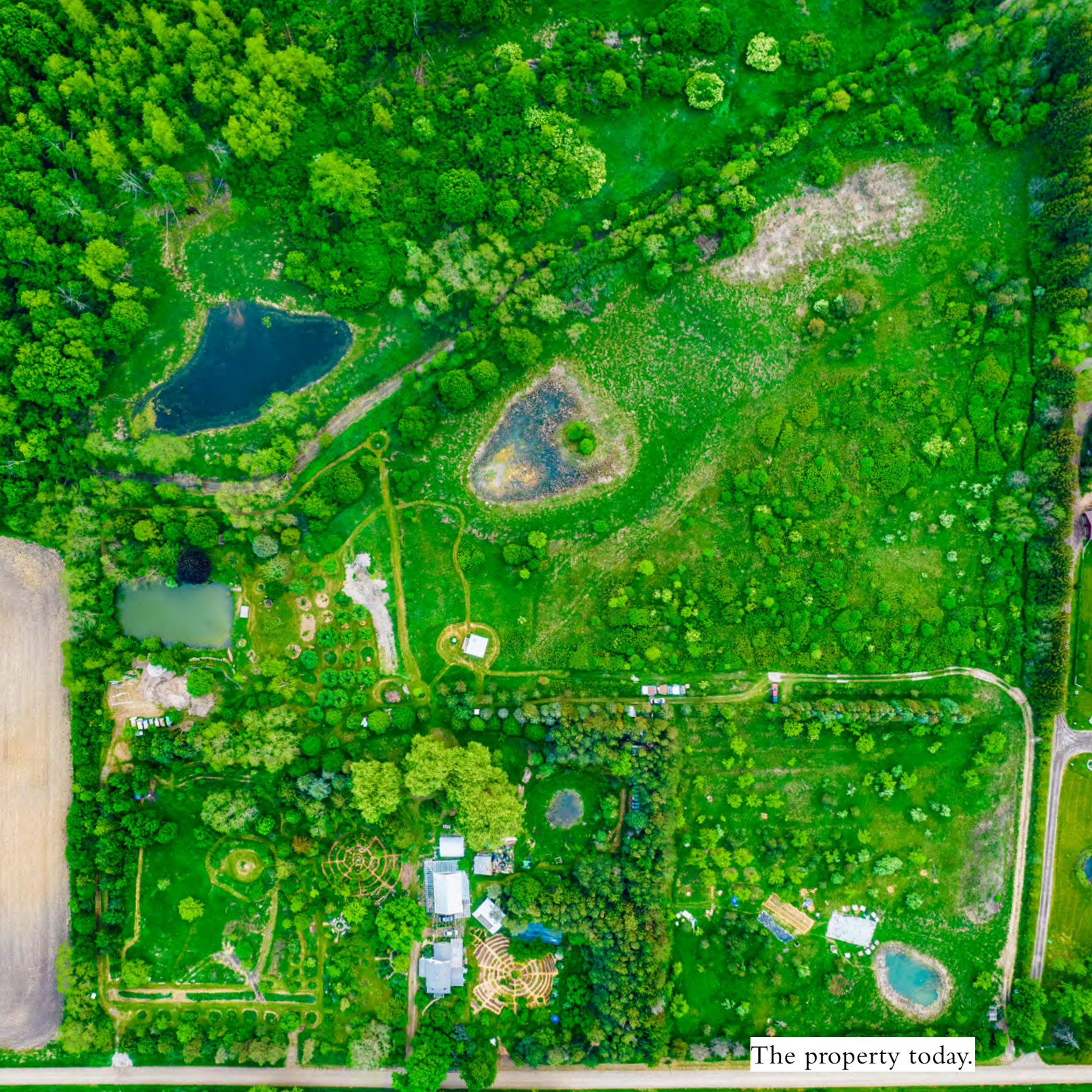
The property today.